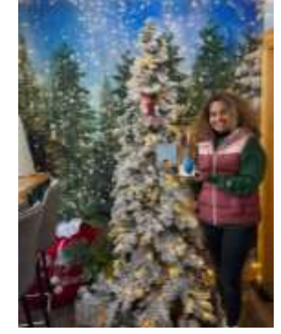
Brightest (a.k.a. the Griswold Award) Mi Cartagena Café