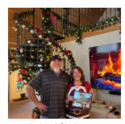
Judges' Choice Alysia's Art Studio