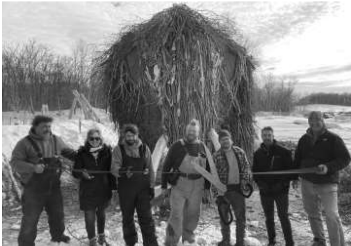
Congrats to Project 412 and Detroit Mountain Recreation Area on the completion of the woolly mammoth art installation in the natural playground area. Artists completed this interactive sculpture in the cold January/February weather. "Mashaal the Mammoth" stands 20' tall, 30' long, and 8' wide. AND you can go inside!