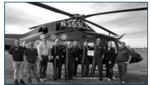
Life Link III celebrated with a ribbon cutting of "Life Link 12" on September 22nd at their facility at the DL Airport.