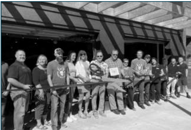
On September 2nd, Bucks Mill Brewing officially cut the ribbon on their new brewery in Downtown Detroit Lakes. This brewery and event space offers an ever-changing beverage selection of beer, seltzers, sours and non-alcoholic options.