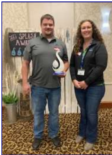
Lighthouse Award BTD Manufacturing