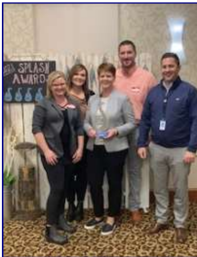
Ripple Award Essentia Health