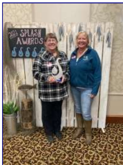
Wave Award Friends of Tamarac