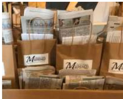
DL Newspapers, Ice Cream Truck, The Becker County Museum and many donors worked to provide science activities for kids as home.