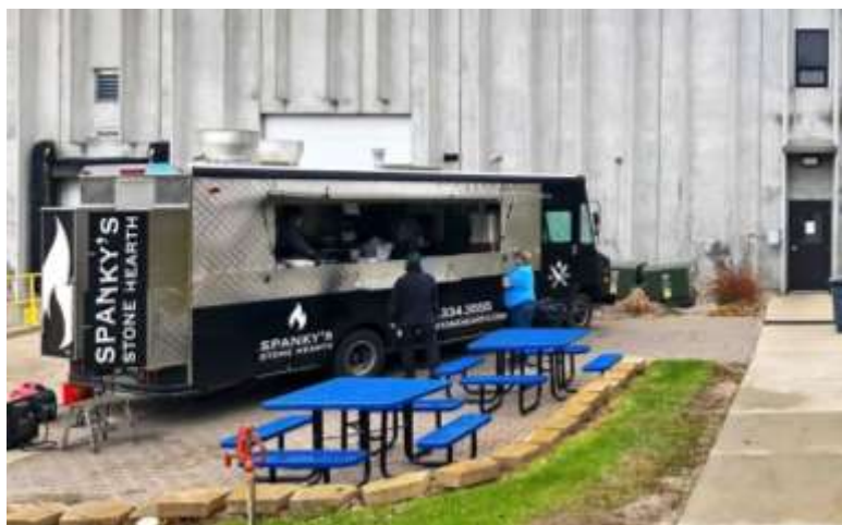
Food trucks have been a great way to bring lunch to employees. Here Spanky's Stone Hearth truck spent the day at SJE as a thank you for the extra work their employees have been doing.

We have seen a lot of partnerships formed between DL Chamber Members! Loans, grants, protective equipment, employees and client safety measures, work-from-home, appointment only... there have been lots of new measures to take to keep local businesses running. Through that many new or strengthened partnerships have occurred! Below are just a few examples; how has your organization partnered with others?