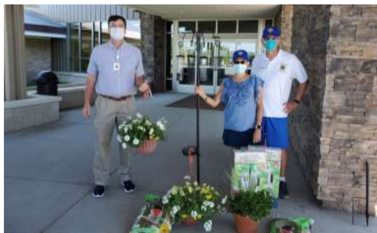
Lions Club of Detroit Lakes recently donated flowers, bird feeders and bird seed to Ecumen . This will help brighten the day for many of their residents.