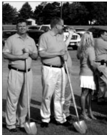
Pet Care Systems breaking ground in July on their $4.2 million expansion in DL