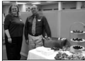
DL Newspaper hosted the October Sunset Social

If your business would like to host a Sunrise or Sunset Social please call the Chamber Office.