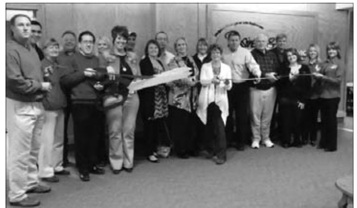
Ambassadors participated in the Ribbon Cutting for the expansion of M State BES , Detroit Lakes. They have added 4 more offices to their existing 9 spaces on the DL Campus. The Chamber ambassadors are pictured with M State staff and BES advisory board members.