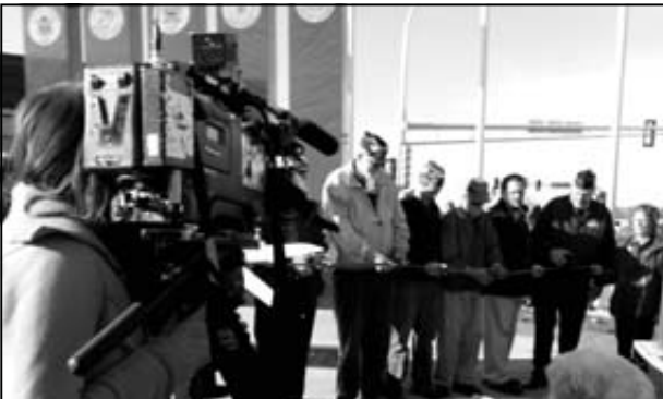
The Chamber Ambassadors assisted with the Ribbon Cutting and Dedication ceremony for the Veteran's Memorial Park on 11/11/11. Paver order forms are still available at the Chamber Office.

Cenex Convenience Store of DL surprised the Chamber staff with a Hot Stuff breakfast pizza delivered right to the office. Each week a Hot Stuff is delivered to one lucky business. Thanks!