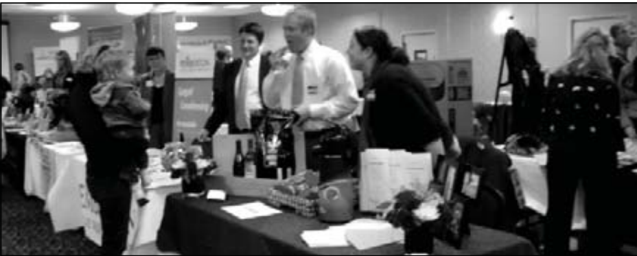
The Chamber Business Showcase on Nov 10th was a great success. Thanks to our sponsors: MMCDC, Multiple Technologies and the Holiday Inn . Pictured are members having fun at the La Barista booth.